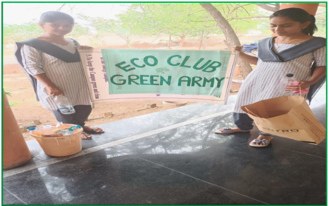
PLASTIC COLLECTION BY GREEN ARMY