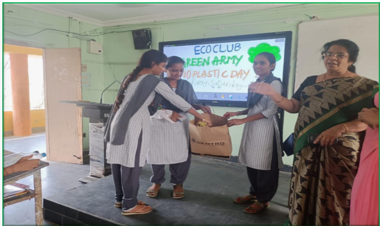
PLASTIC COLLECTION BY GREEN ARMY