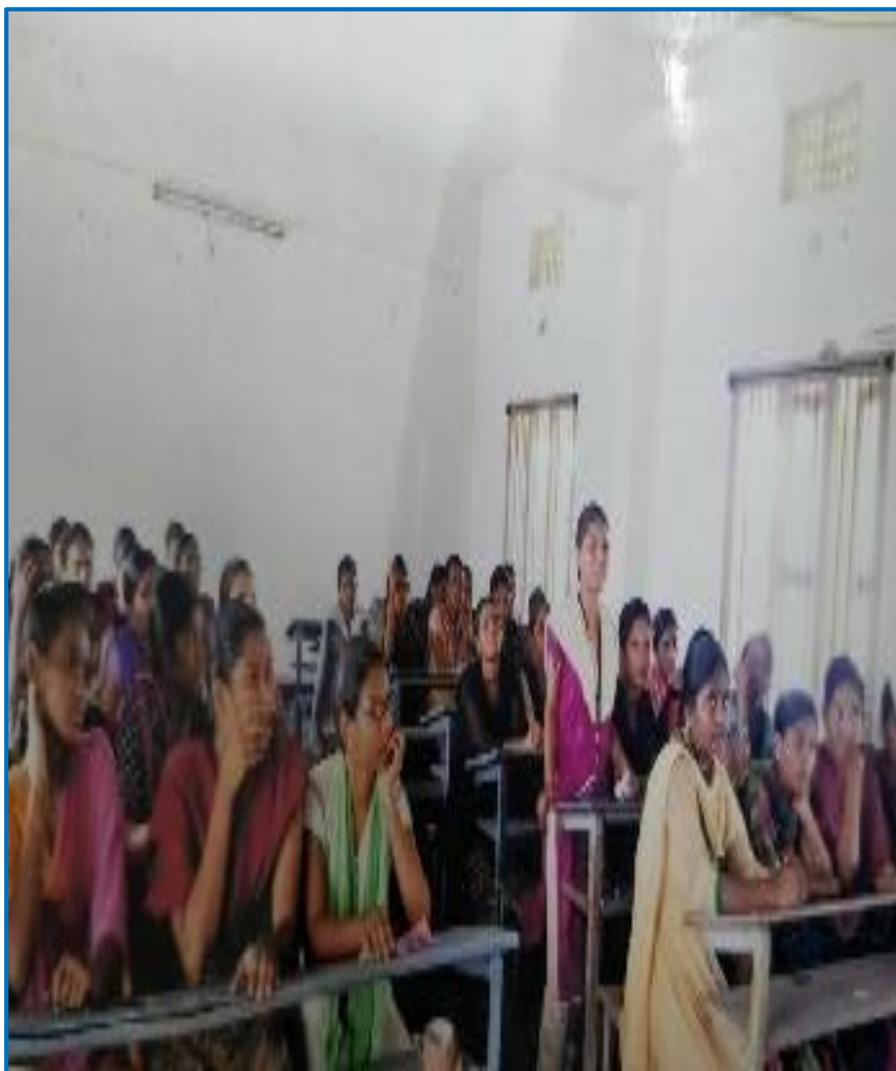
PARTICIPATION OF STUDENTS IN THE QUIZ