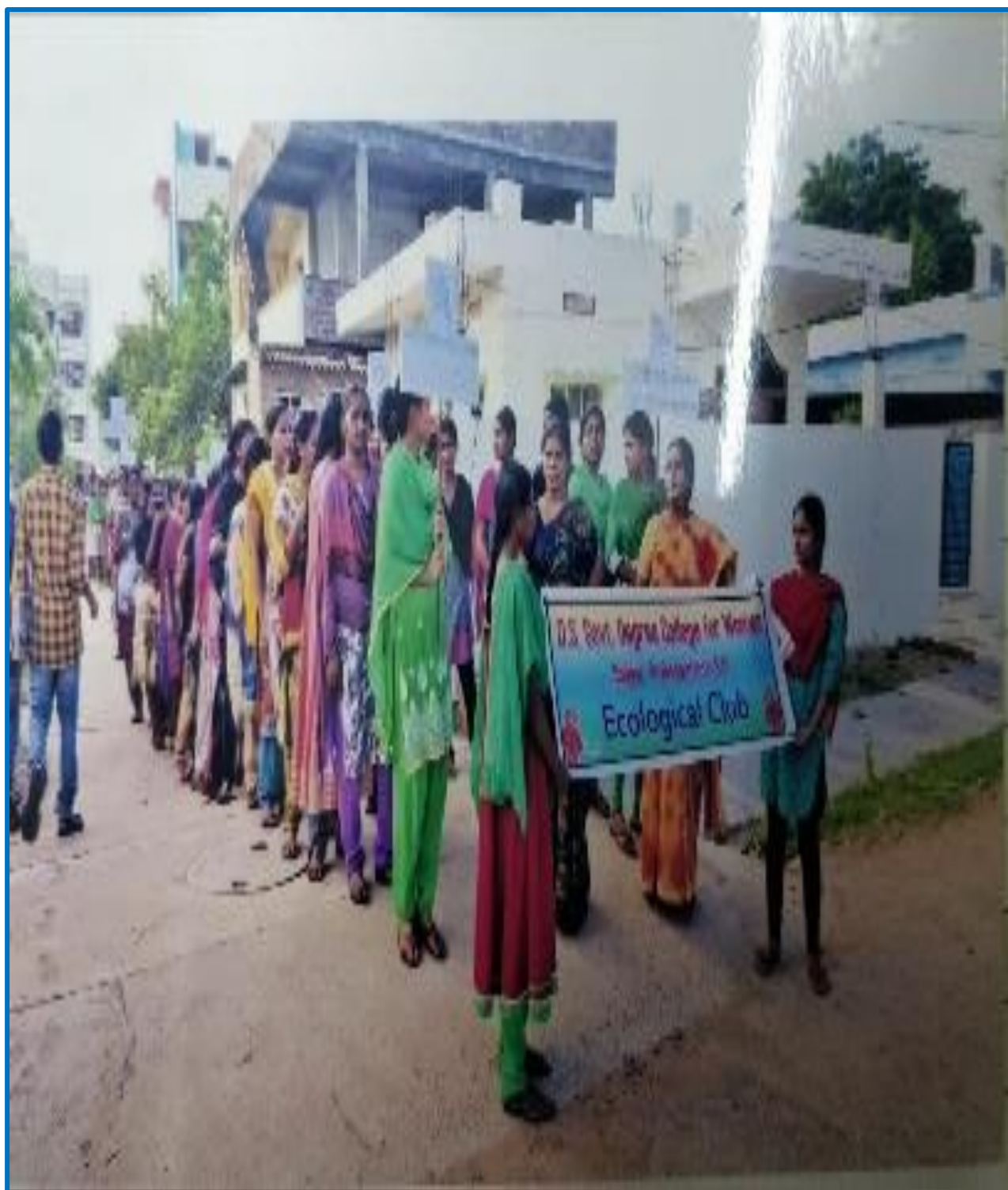
AWARENESS RALLY OF THE STUDENTS ON THE OCCASION OF INTERNATIONAL OZONE DAY