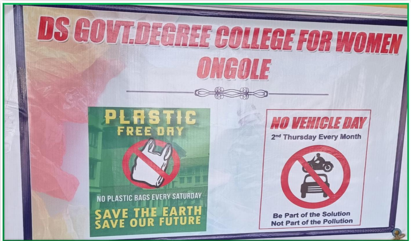
GREEN ARMY (ECO CLUB) BANNER IN THE COLLEGE