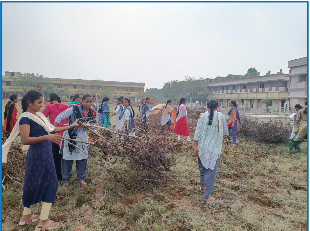
SEGREGATION OF THE DRY BRANCHES