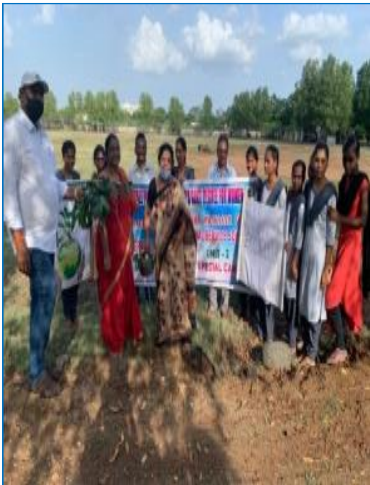
PLANTATION BY ECOCLUB AND NSS